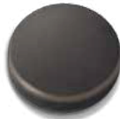
Oil Rubbed Bronze